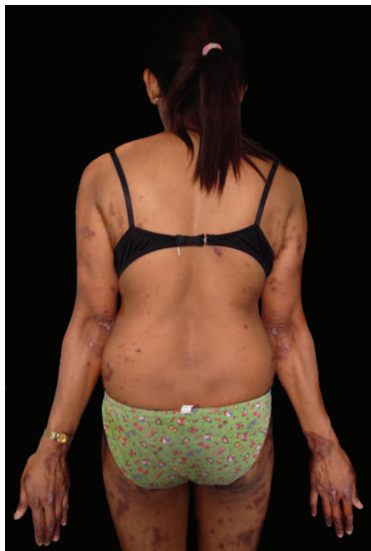
Figure 1 Multiple erythematous papules and plaques, and a few intact vesicles on the back, extensor surfaces of the extremities and gluteal areas.

A 41-year old Filipino female came to our clinic due to multiple papules and vesicles (Figure 1). The condition started a year prior to consultation as multiple pruritic papules and vesicles, which progressed to patches and plaques with erosions on the chest, trunk, axilla, gluteal area, and extensor surfaces of the extremities. There were no fever, pain, or body malaise. No medications were taken or applied on the skin before