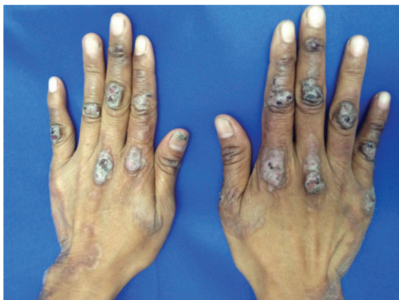
Figure 3 Hyperpigmented and lichenified plaques with erosions on the dorsum of the hands.