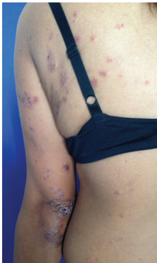
Figure 2 Closer view of erythematous papules and plaques, with erosions and crusts.